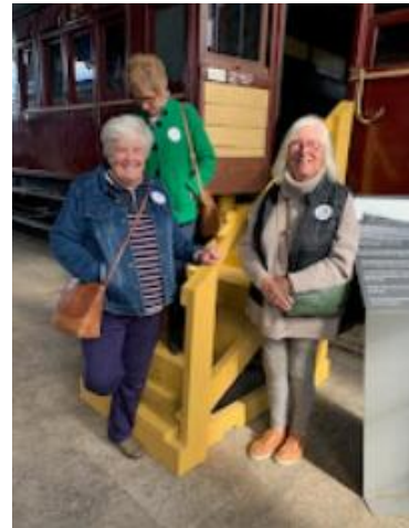
The Roundhouse Museum