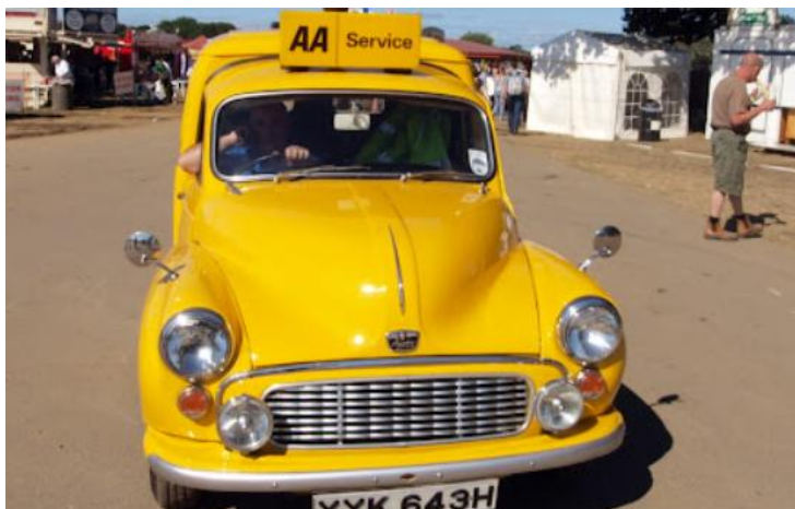
Rebadged to Austin AA Service Unit