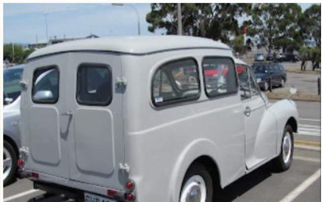
Morris Minor Panel Van