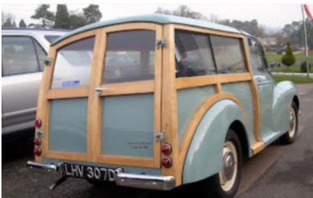
Morris Minor traveller