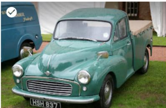
Morris Minor Pick up

Photos below show some of the models produced.