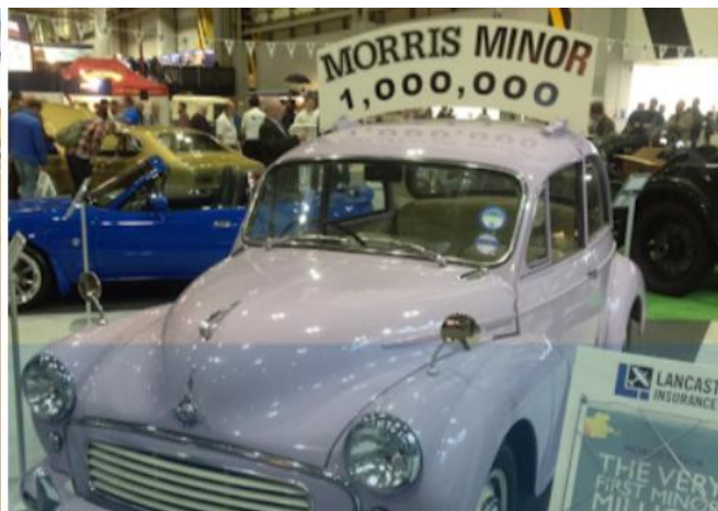
1,000,000 th MM sedan produced in the UK