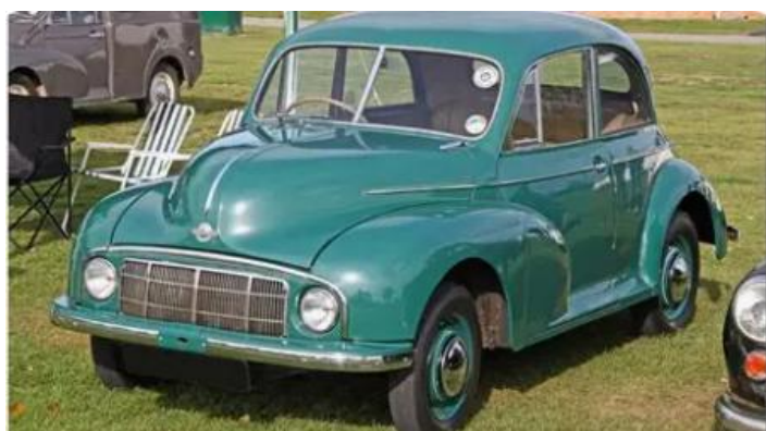
1948 Series MM