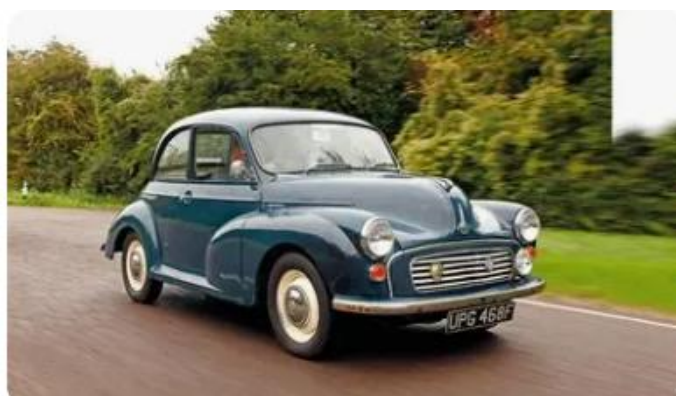
2 door MM 1000