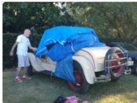
The A model getting ready for bed.