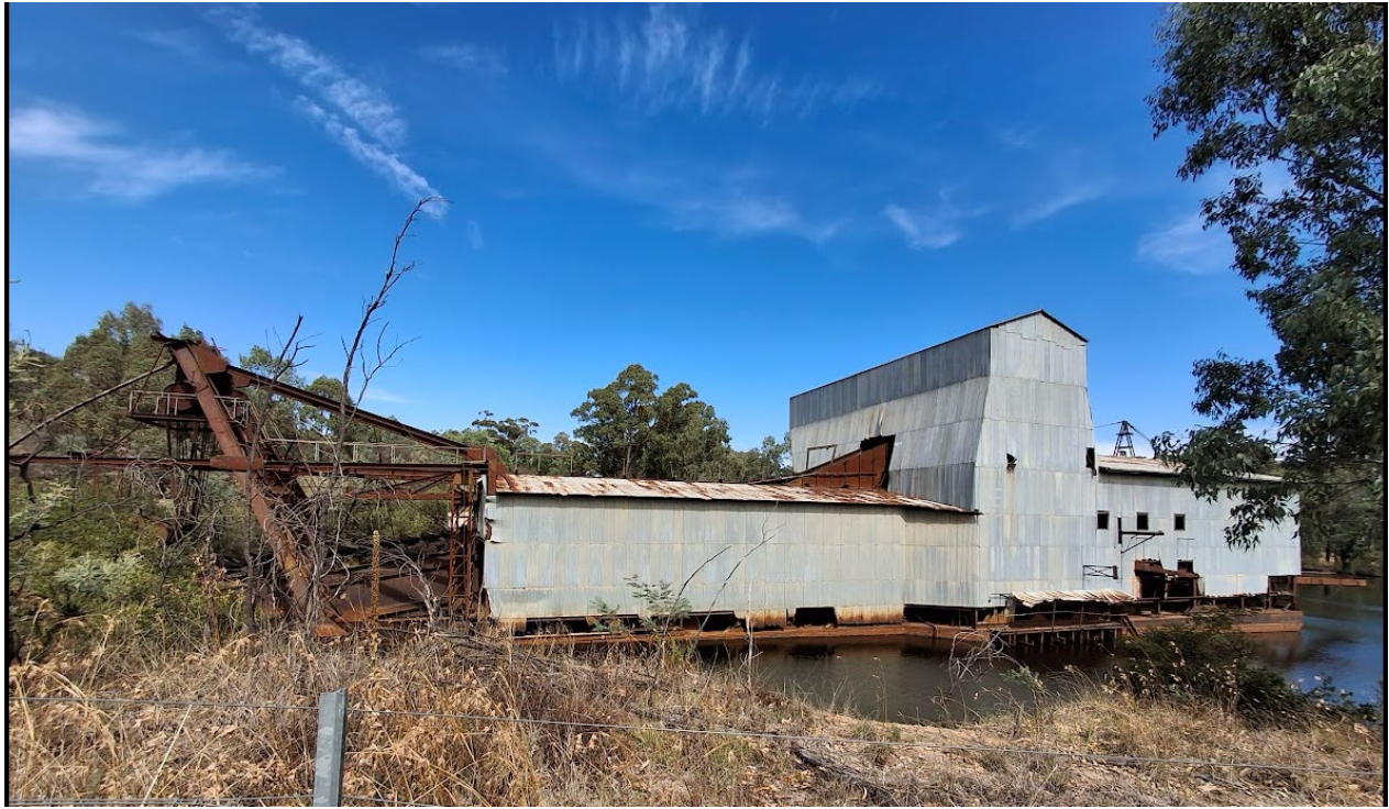
It operated between 1936 and 1954 and recovered 2.2 tonnes of gold