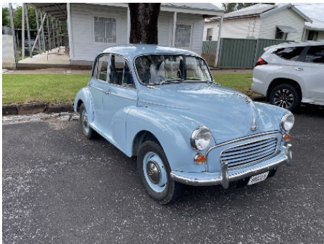
Liz Schell winning the Gnoo Blas Ladies Day with the Morris 1000