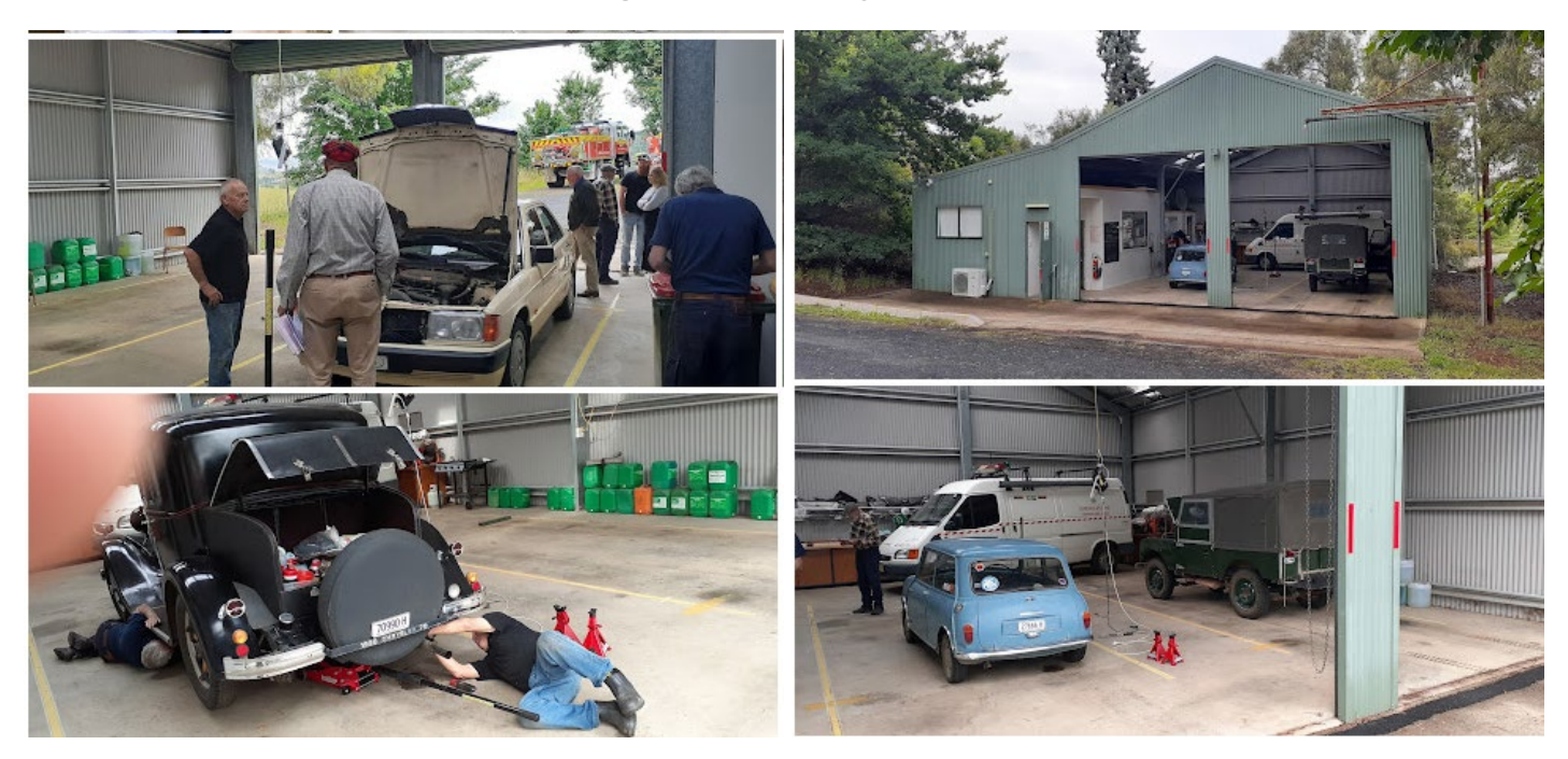
Cars being inspected by the Scrutineers at Lucknow RFS Shed