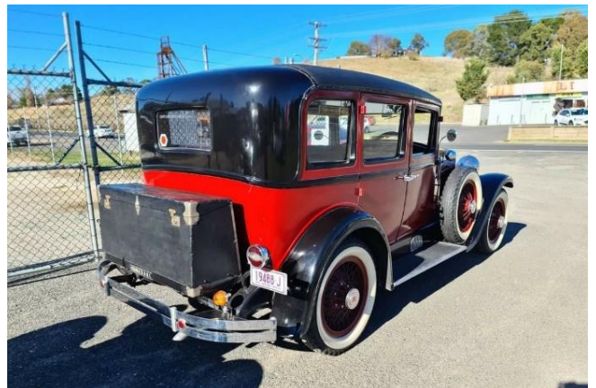
Good photo from the rear at Lucknow