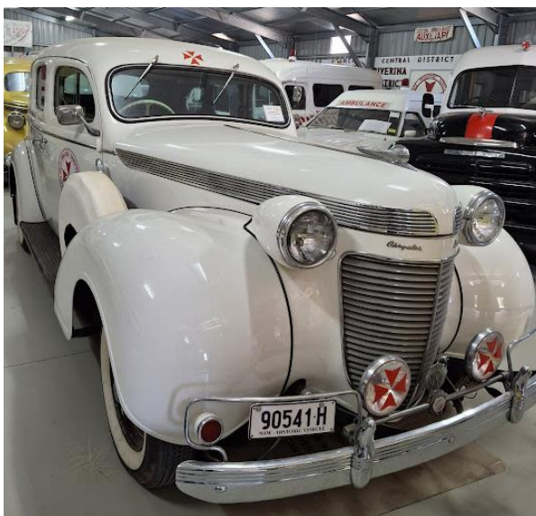
A model ambulance collection