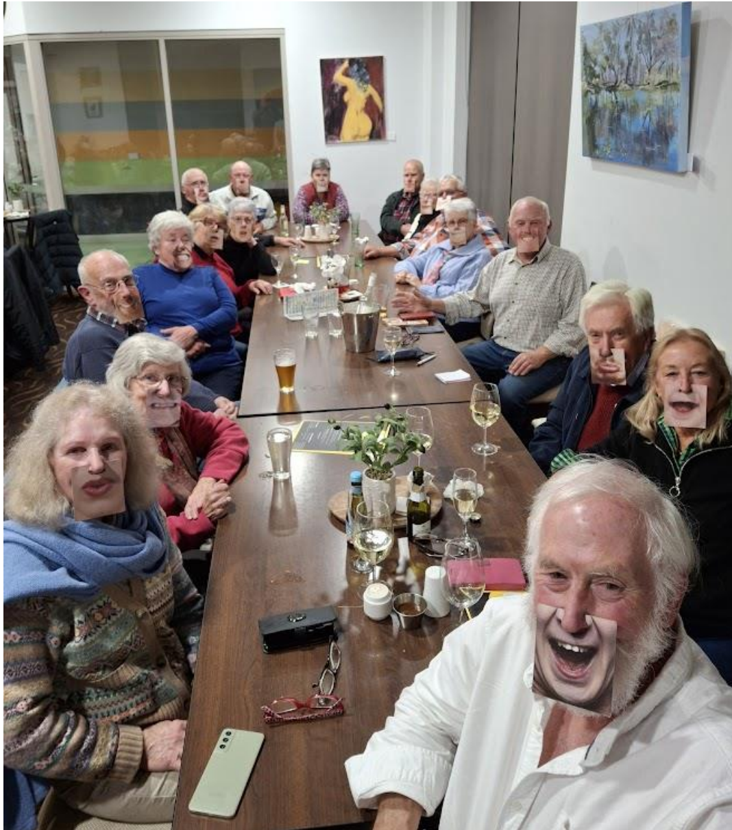
A strange bunch of people seen at the Temora Ex-Services Club recently. Can anyone spot Donald Trump???