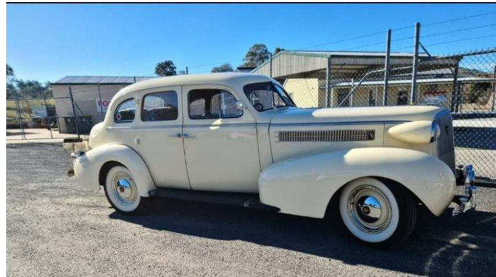
Magill's Cadillac on National Heritage Motoring day