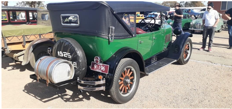
A 1925 Dodge with an interesting toolbox on the back- an ideal use for an old beer keg