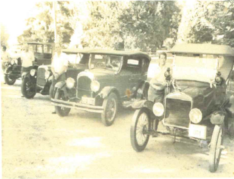
March 1972 Cook Park