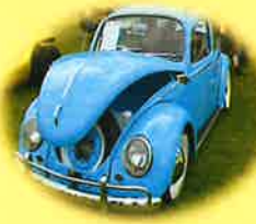
Car, Bike & Tractor Show