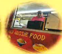
Great Food, Drinks & Ice Cream