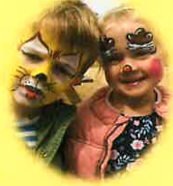
Free Face Painting