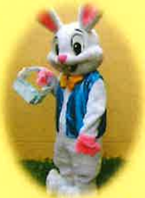
Free Easter Egg Hunt