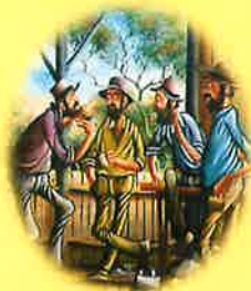
Best Beard Comp