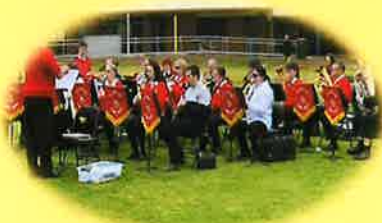
Wellington Town Band