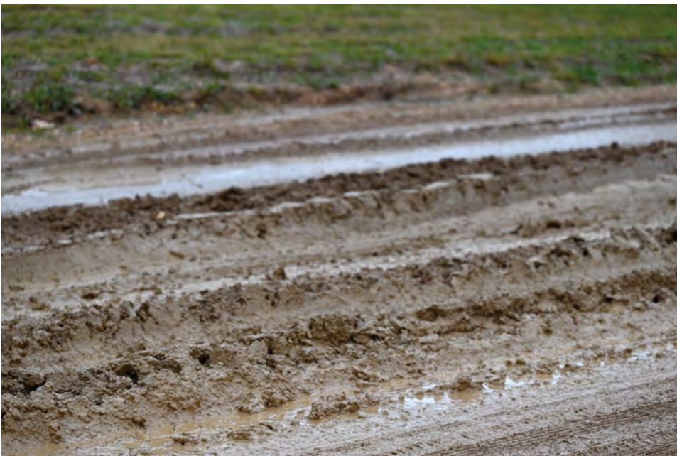
The condition of the Molong Showground entrance road last Saturday. Even when dry - it's a shocker for such a small length of track.

We are not sure who is responsible for the short stretch of road leading into the Molong Showground, Golf Course and Caravan Park. Now acknowledged as an important and increasingly busy tourist road, the gravel track leading into the Showgrounds/Golf Club/ Caravan Park/Function-Events venue is far from satisfactory nor safe for the kind of usage that the site attracts.