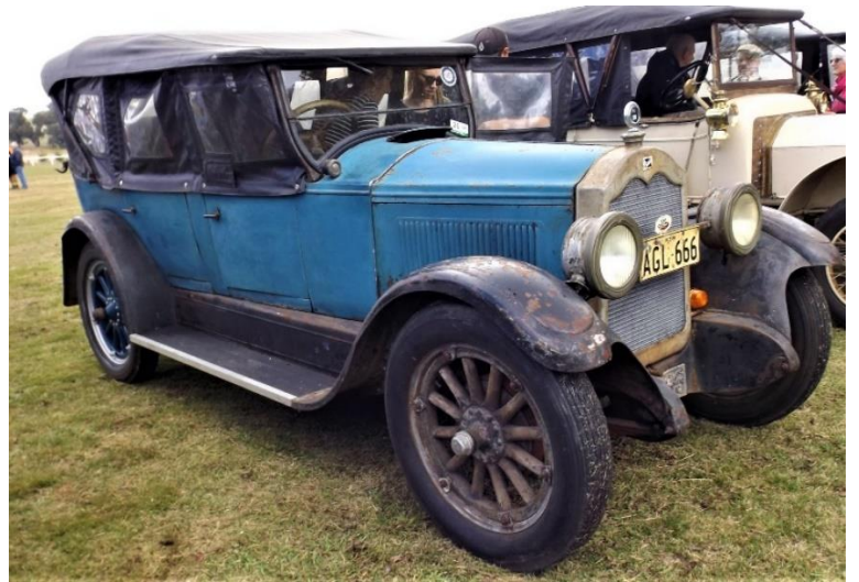
Most Original: Eliza Dorner's 1925 Buick