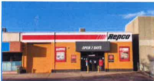
Repco Orange, 97 Kite St, Orange