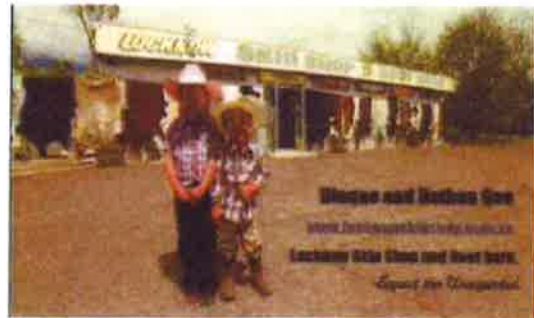
Lucknow Skin Shop & Boot Barn