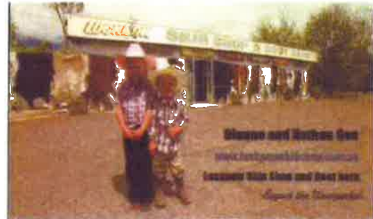
Lucknow Skin Shop & Boot Barn