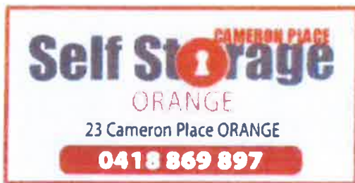
Cameron Place Self Storage