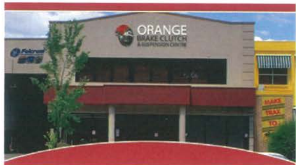
ORANGE BRAKE CLUTCH & SUSPENSION CENTRE NEXT DOOR TO JAX TYRES