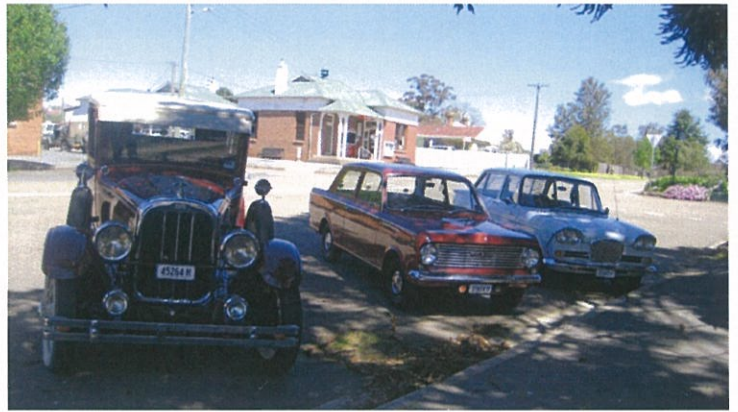
Lunch at Binalong