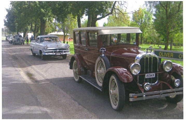
Morning Tea at Cowra – ready for departure