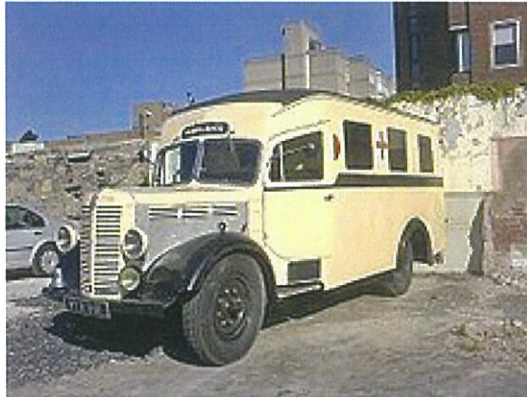
1930s Bedford Ambulance