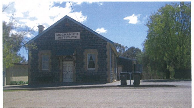
Old buildings in Binalong