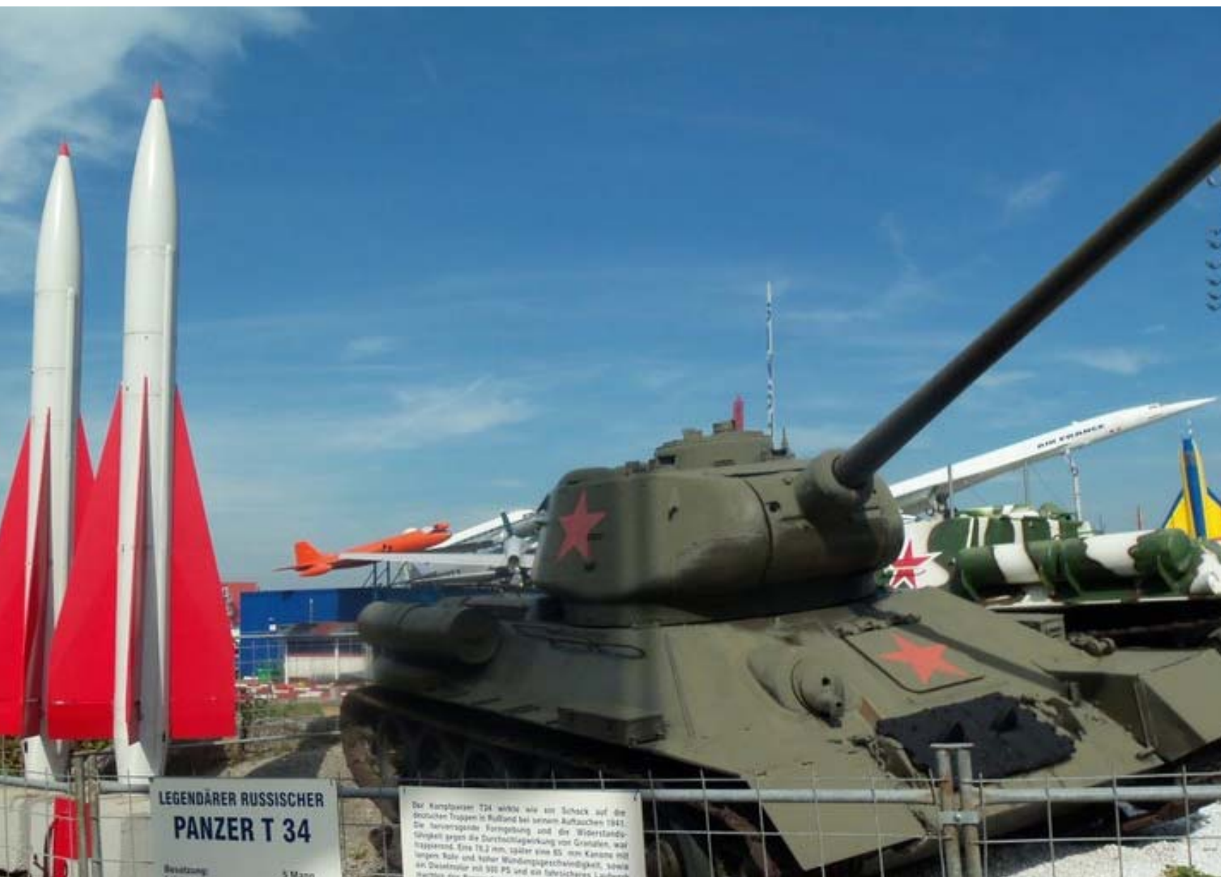
LEGENDÄRER RUSSISCHER PANZER T 34