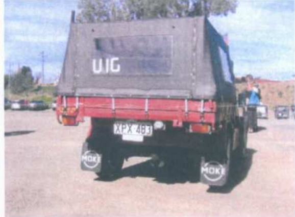
Moke with table top from WA