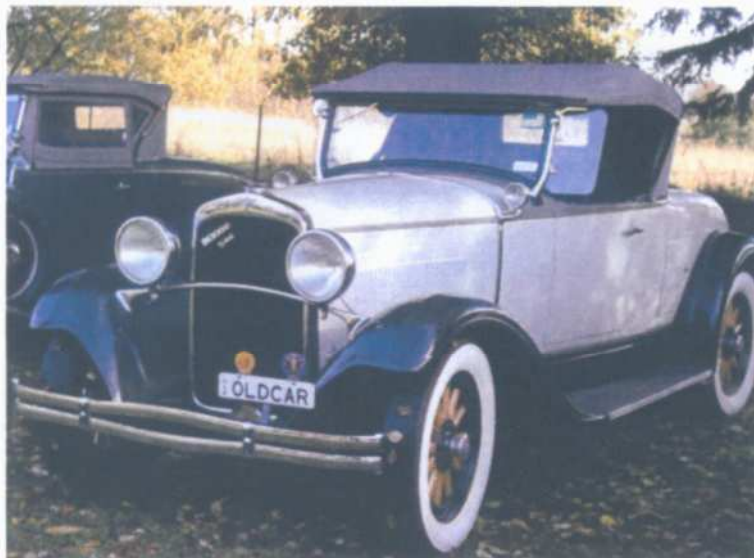
65 1929 Dodge DA Gary Roach