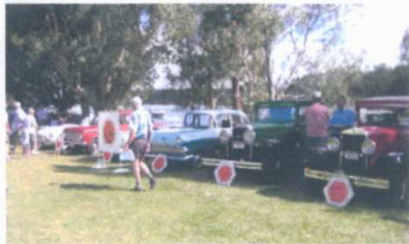
Display at Foster Keys