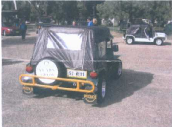
Moke from Tasmania