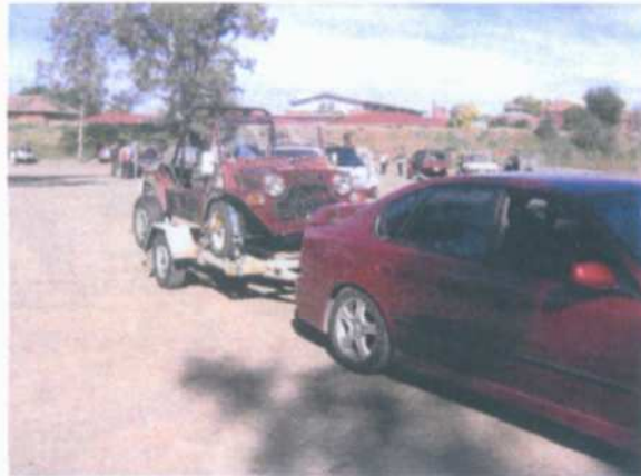
Bob's Moke on the trailer