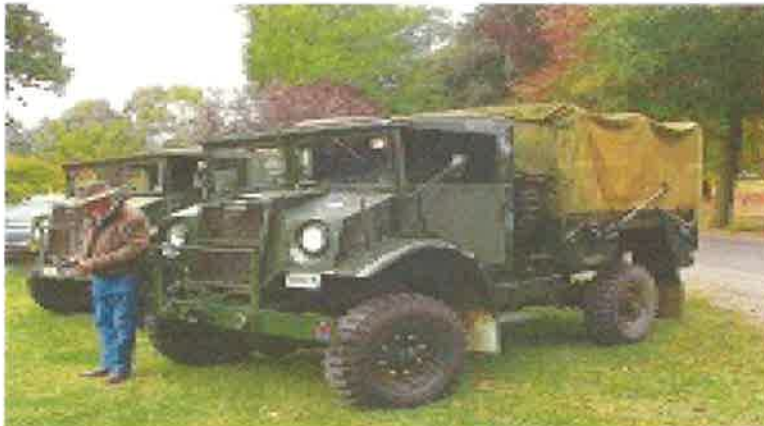
The two Blitz's one Chev one Ford. On display at the Neville ANZAC day celebrations 2019