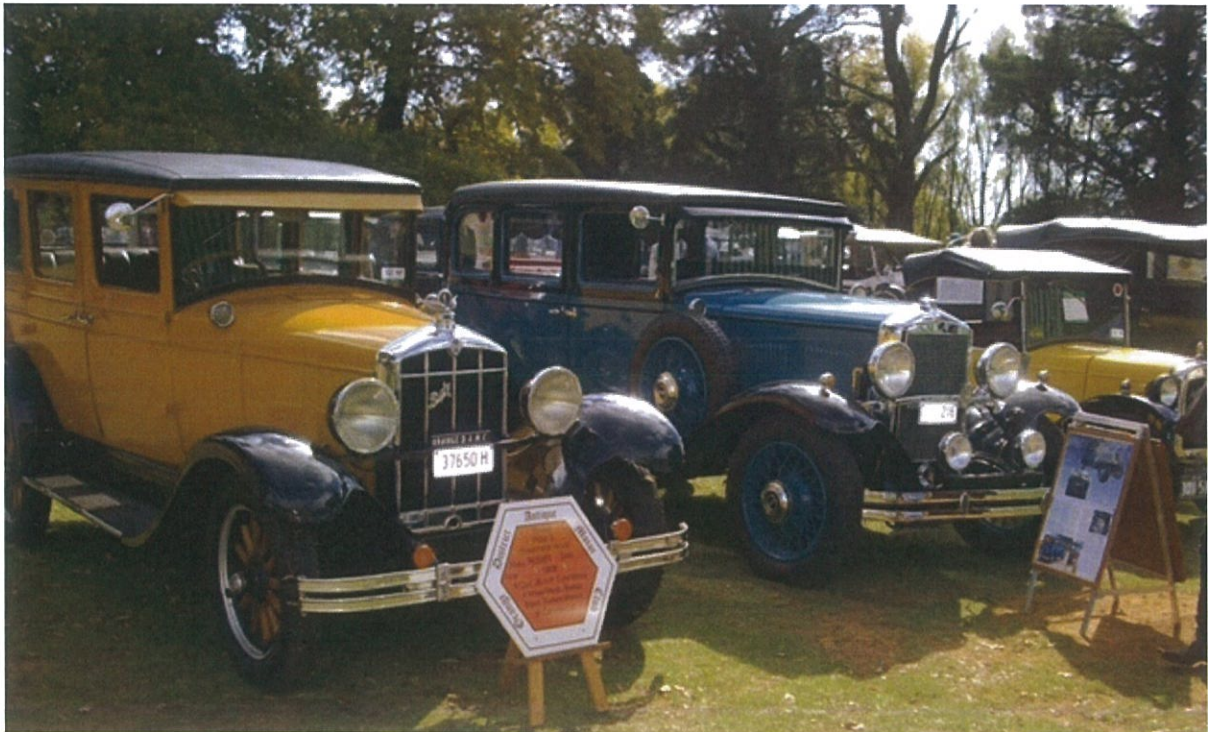
1928 Rugby – 4 cylinder