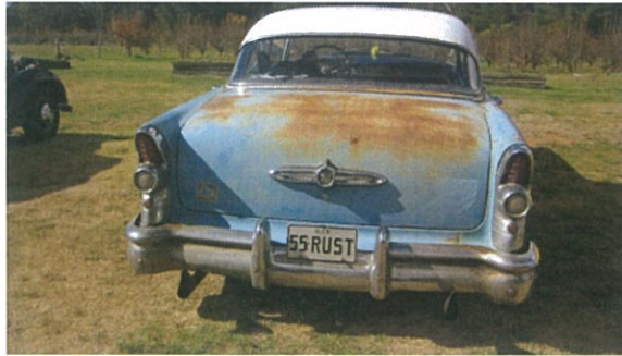
Great number plate