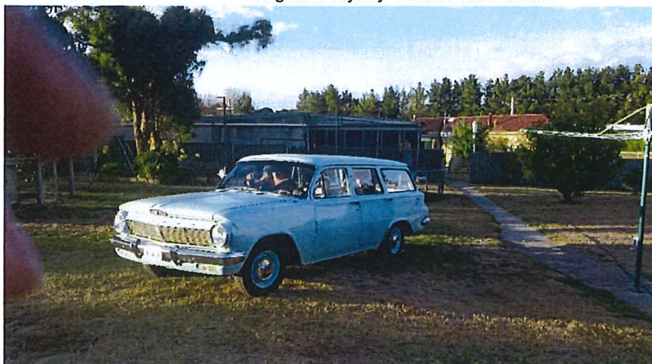
Original Blayney Vehicle Unrestored