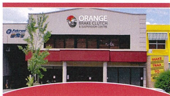
ORANGE BRAKE CLUTCH & SUSPENSION CENTRE NEXT DOOR TO JAX TYRES