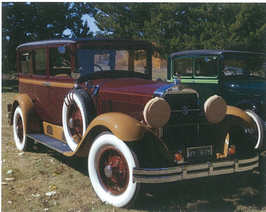
People's Choice: 1929 Studebaker President 8