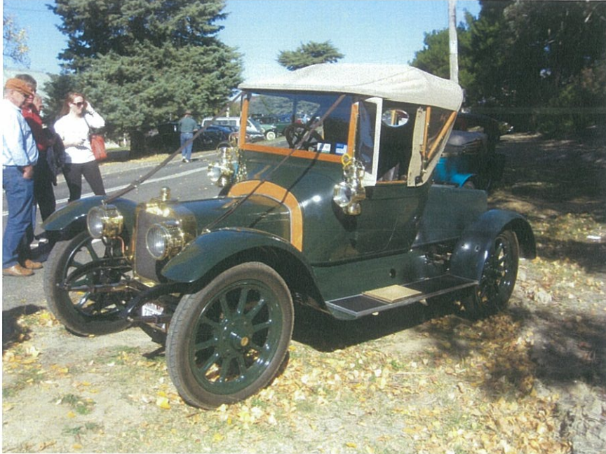
Best Veteran Vehicle: 1913 Talbot 12HP ACT