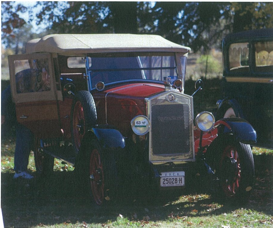
Best Vintage Vehicle: 1926 Bayliss Thomas