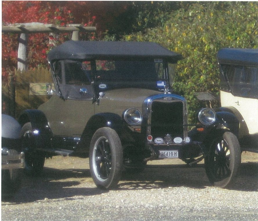
Shannon's Choice: 1925 Chevrolet Superior K