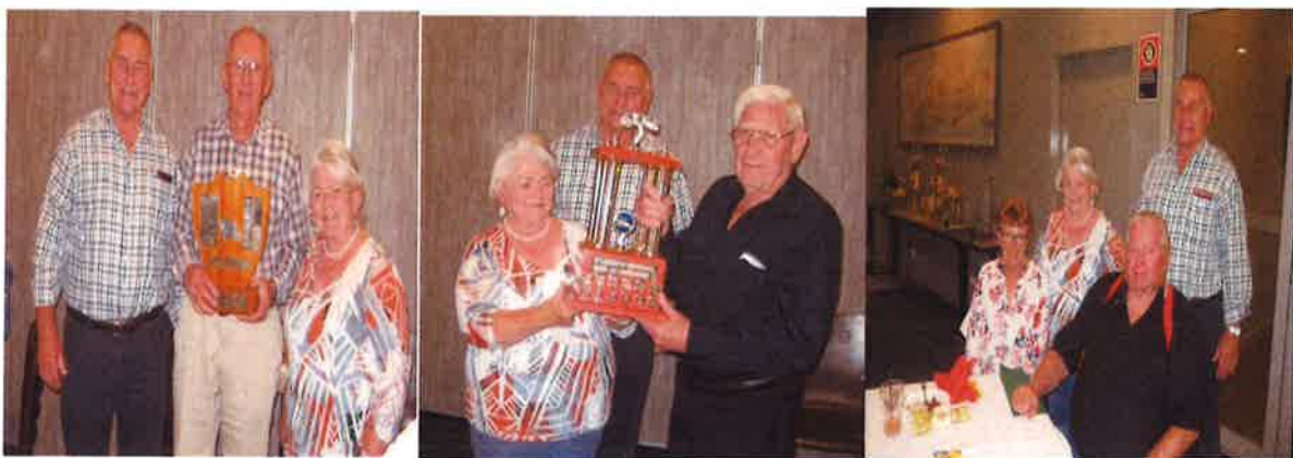
Rosemarie also sent in some pictures from the Christmas dinner and presentation night.