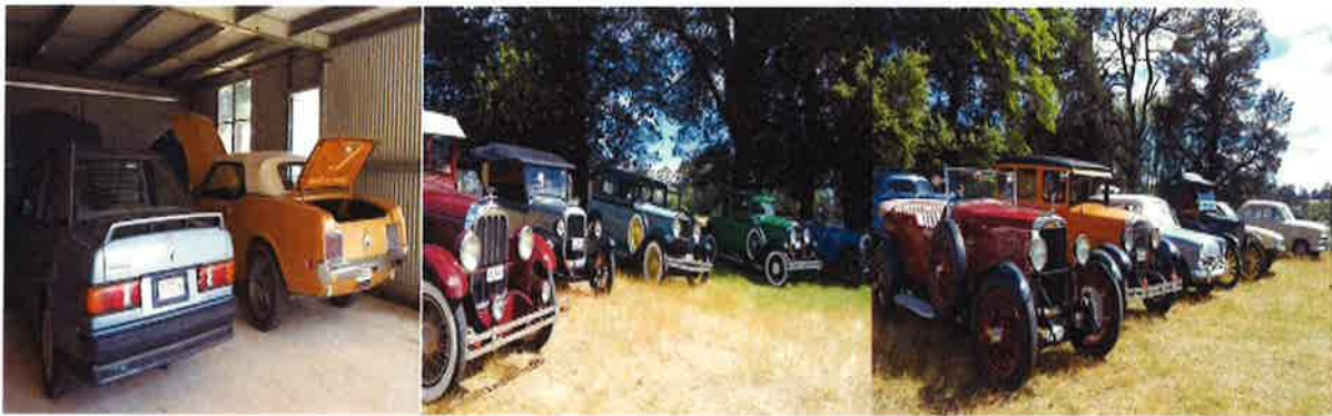
1. A few heads under the bonnet, 2 & 3 Cars lined up waiting to be inspected at the Club Rego Day.