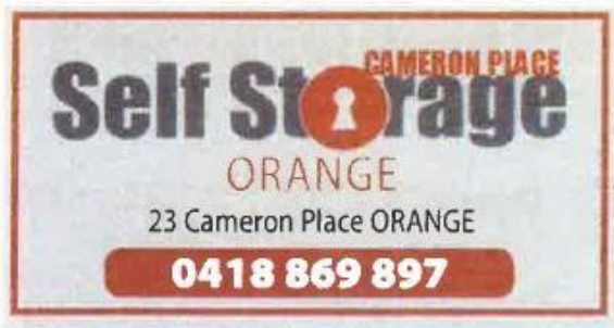
Cameron Place Self Storage