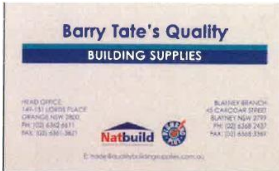
Barry Tate's Quality Building Supplies Barn

ODAMC wishes to thank the following sponsors for their assistance in publishing this magazine. Club members are asked to support the people that support us.