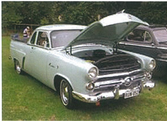
1952 Ford V8 Mainline Coupe Utility

In Australia the Mainline name was applied to a locally developed 2-door coupé utility version of the Ford Customline sedan from 1952. The Mainline utilized an imported Ford V8 convertible chassis with the large X-member for additional load carrying strength. It sold alongside the Australian built Customline sedan, with both given yearly updates until production ceased in 1959. The coupe utility slot in Ford Australia's lineup was filled by the first Ford Falcon utility the following year. The Mainline Utility was powered by an Australian produced version of the Ford side-valve V8 engine until the introduction of the OHV V8 in the redesigned 1955 series.