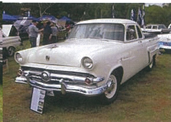
1954 Ford V8 Mainline Coupe Utility