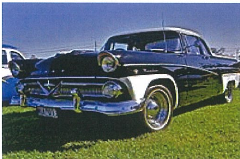
1958 Ford V8 Mainline Coupe Utility