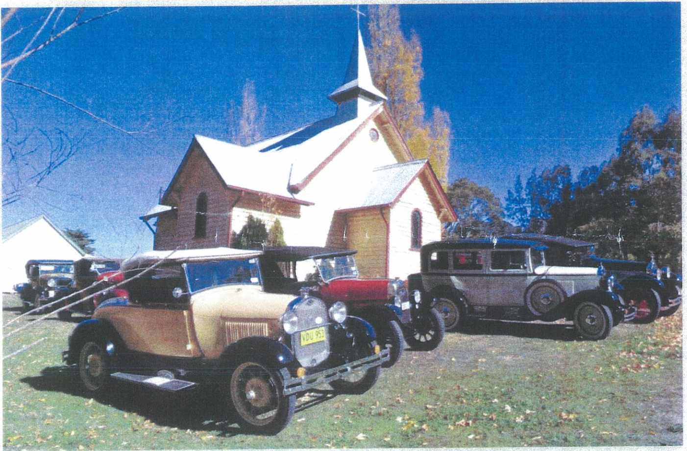
A few of the 75 veteran and vintage cars on the ODAMC's AUTUMN TOUR 2013

My contact details are 63659224 or 0428659224 and my email is cbromley111@optusnet.com.au for any information, news, Pictures or anything that we can add to the newsletter. All is gratefully appreciated.