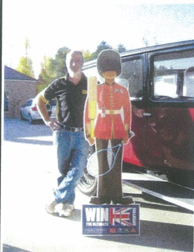
Left: A very British guard for Bradshaw's Sunbeam Right: Not a car sales yard but just some of the cars at the Saturday Start, Orange.

Tool chest and everything else packed we headed back to Rally HQ for the famous ODAMC free farewell breakfast. A last chance for photos and to talk to other rallyists before we set off on an uneventful and pleasant drive home.