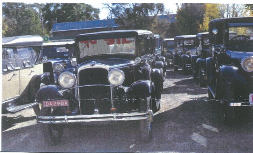
Left: 1913 Talbot, De Soto, De Soto, 1929 Olds, Sunbeam Right: '28 Olds follows 1929 Chev and 1926 Chev Wagon