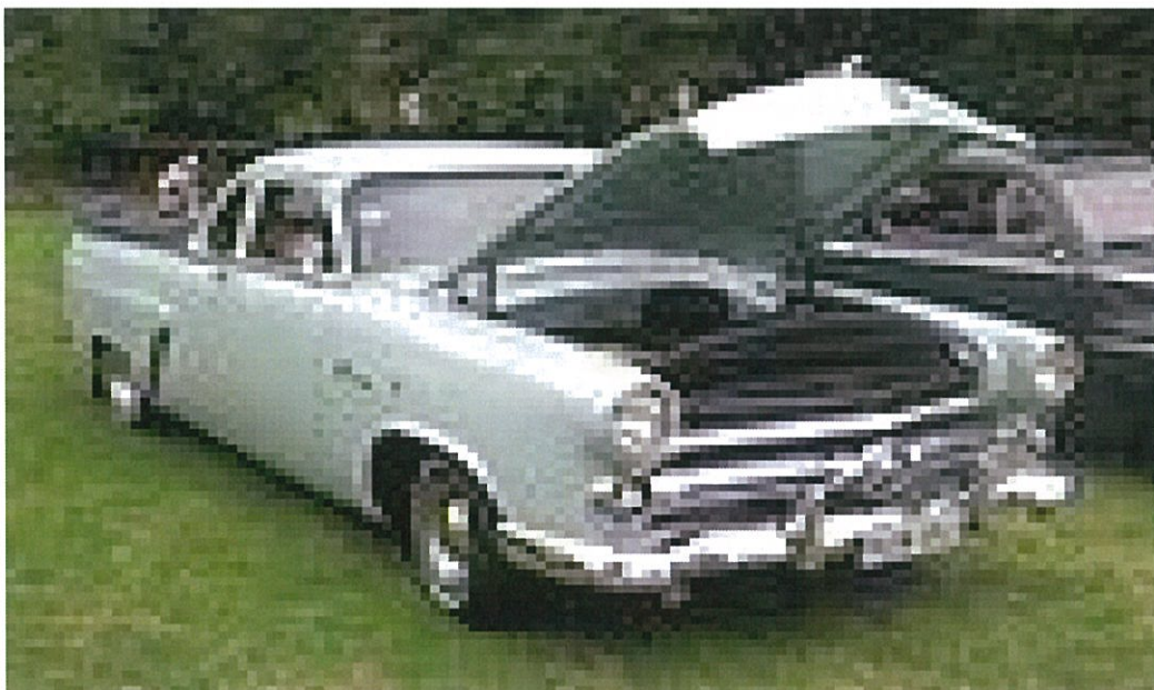
1952 Ford Mainline Coupe Utility

In Australia the Mainline name was applied to a locally developed 2-door coupé utility version of the Ford Customline sedan from 1952 The Mainline utilized an imported Ford V8 convertible chassis [10] with the large X-member for additional load carrying strength. It sold alongside the Australian built Customline sedan, with both given yearly updates until production ceased in 1959. [12] The coupe utility slot in Ford Australia's lineup was filled by the first Ford Falcon utility the following year. The Mainline Utility was powered by an Australian produced version of the Ford side-valve V8 engine until the introduction of the OHV V8 in the redesigned 1955 series.