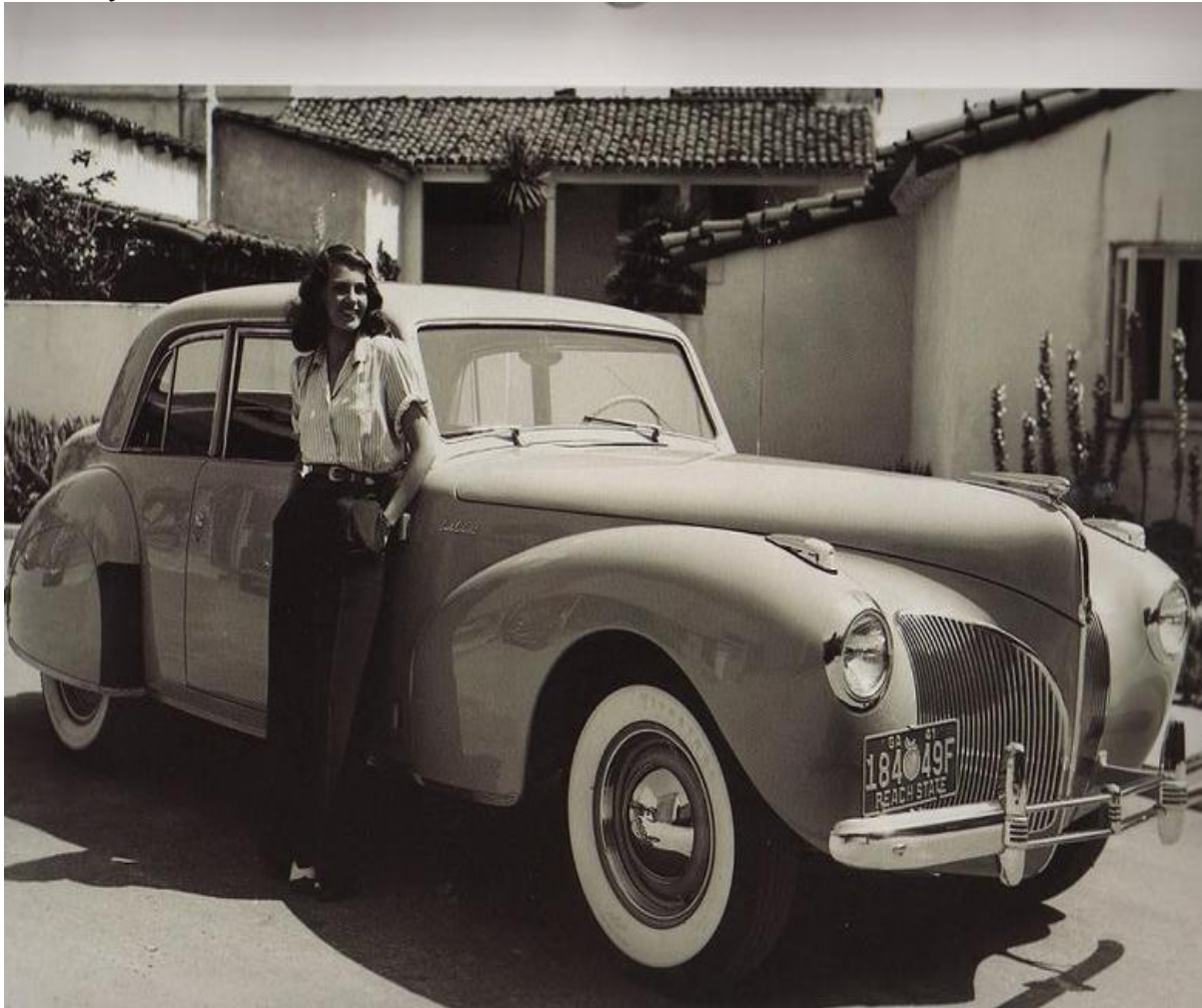
Rita Hayworth 1941 Lincoln Continental

What spectacular photos of an elegant time gone by....never to be duplicated by today's "jelly-bean" cars and our virtual reality actors and actresses.